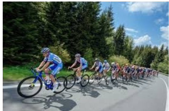
Course de la Paix