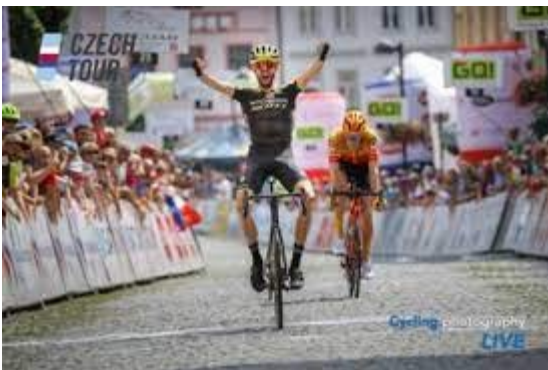
Tour de Tchèque

* professional races with the Bohemian Tour, the Czech Cycling Tour or the Peace Race for men and the Tourdufeminin for women