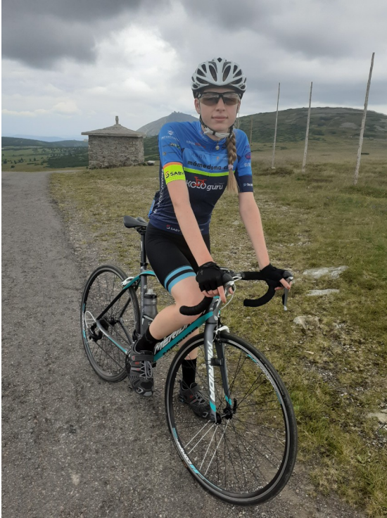
Modré sedlo (1510m)

* altitudes over 1000m reached in the national mountains,