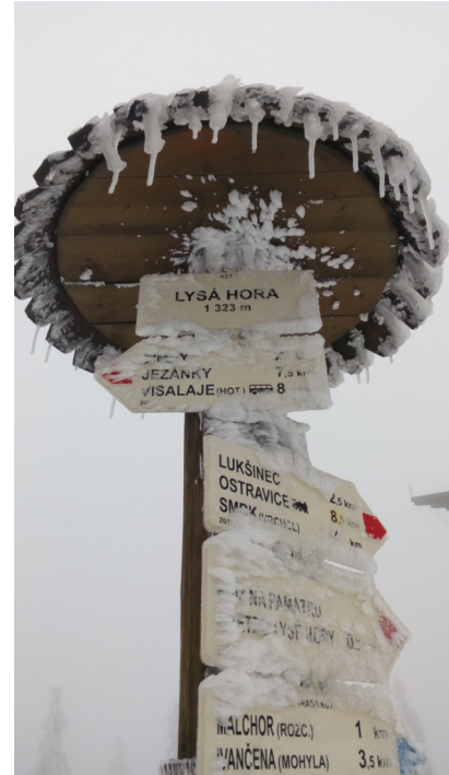
Lysa Hora (1323m)

* not forgetting the cyclo-cross classic races, beautiful sites with Bohemian paradises or Jeseniky landscapes for example,