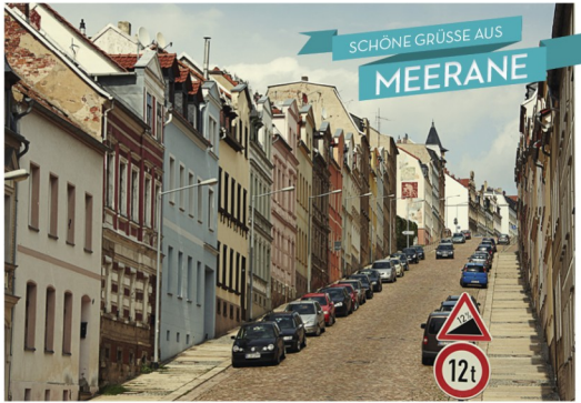
Le fameux mur médiatique de Meerane