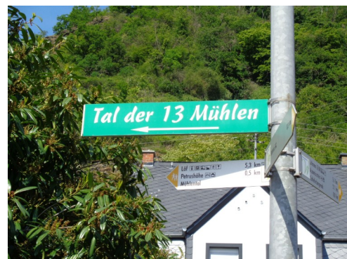
Tal der 13 Mühlen