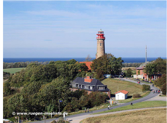
Kap Arkona : l'Allemagne en bord de mer

The national Challenge gives pride of place to places of interest. Among them, several are registered in the UNESCO World Heritage: the Upper Middle Rhine Valley (including Loreley), the rococo church of Wies, the city of Bamberg, the fortress of Wartburg, the Park Wilhelmshöhe near Kassel.