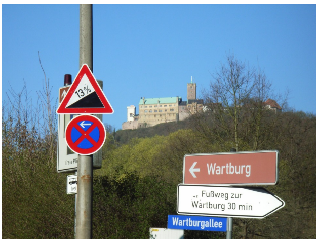
Forteresse de Wartburg

The national Challenge gives pride of place to places of interest. Among them, several are registered in the UNESCO World Heritage: the Upper Middle Rhine Valley (including Loreley), the rococo church of Wies, the city of Bamberg, the fortress of Wartburg, the Park Wilhelmshöhe near Kassel.