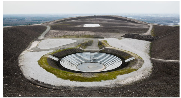
L'amphithéâtre sommital de Halde Haniel

And some unusual places, like an amphitheater set up at the top of a slag heap, or a Soviet airliner, nicknamed "Lady Agnes", landed in the middle of nowhere.