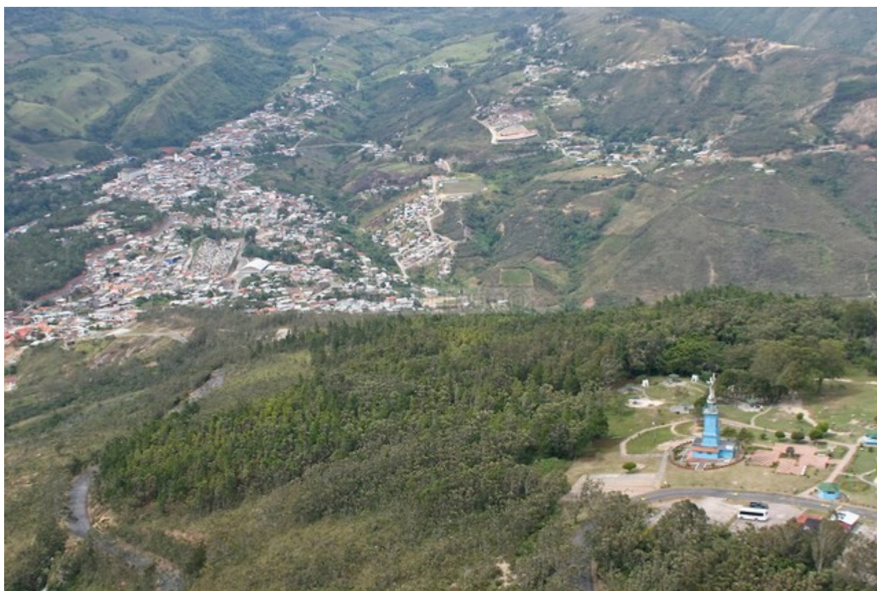
Aerial perspective of the top and Capacho, in the valley

To start this column, let's go to the Táchira, in the West of Venezuela, whose county-town, San Cristóbal, was host of the Road World Championships in 1977.