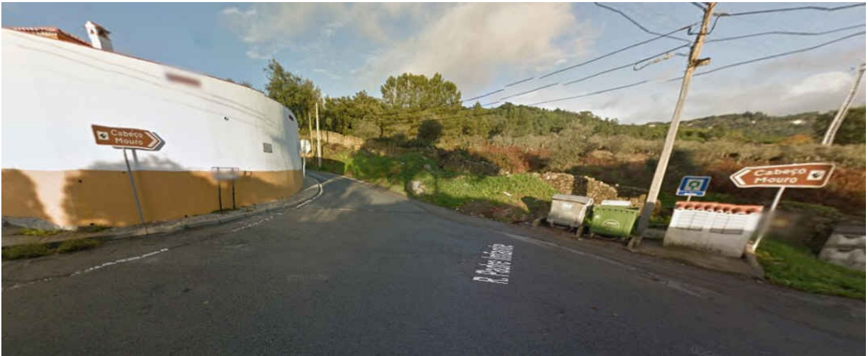
Stereo road sign. Fear of missing it ?