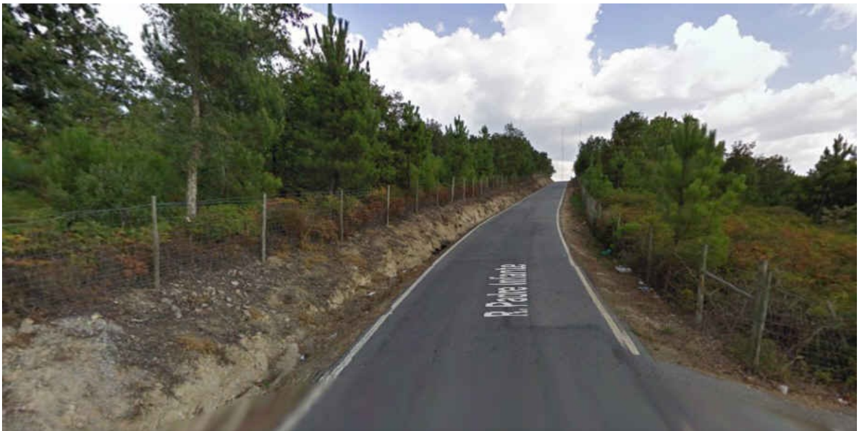
In low-angle shot, the last 300m at 17%