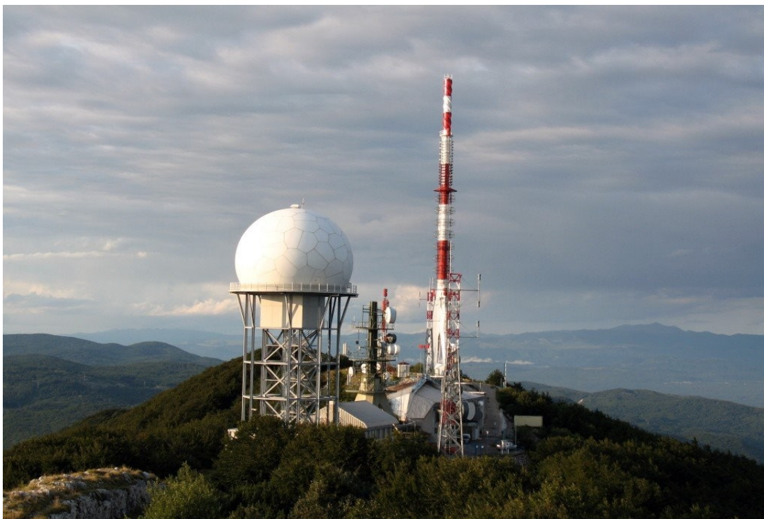
Vojak, Istrian Gate, from Rijeka