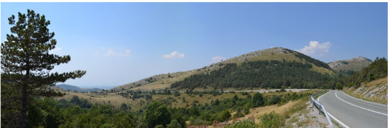
Ridge road (National Road 6)