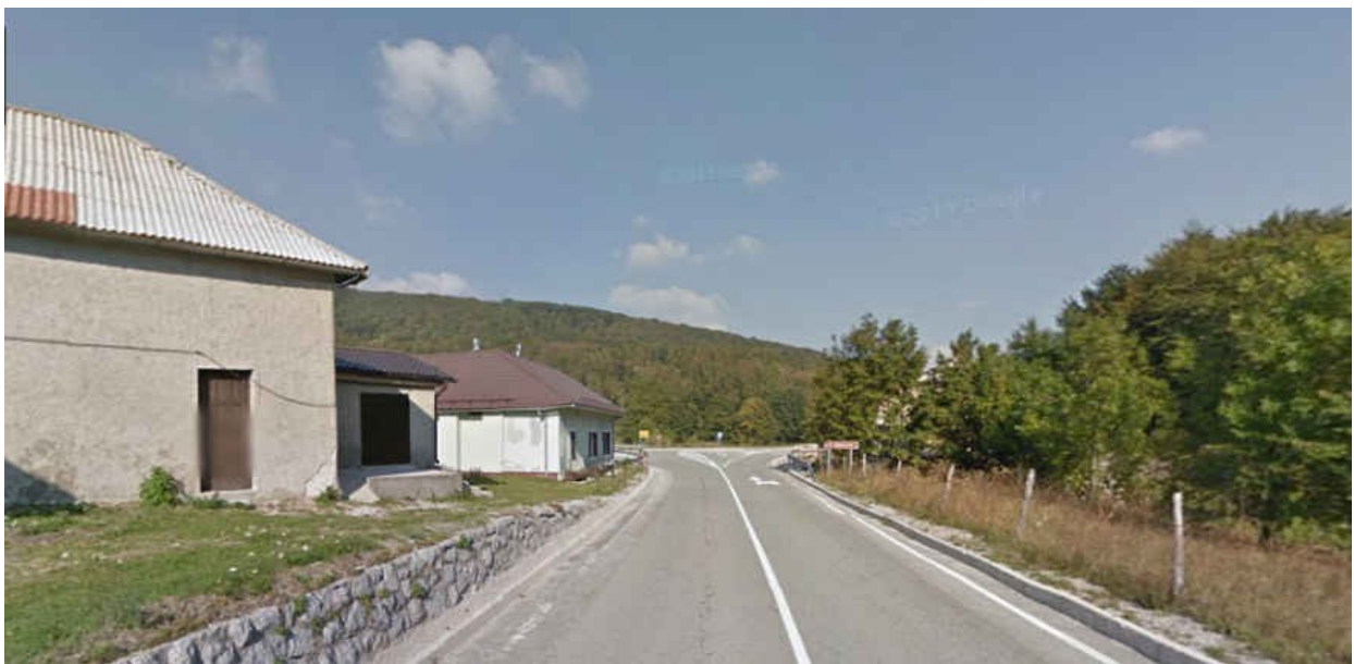
Top at the crossroads with the National Road 6