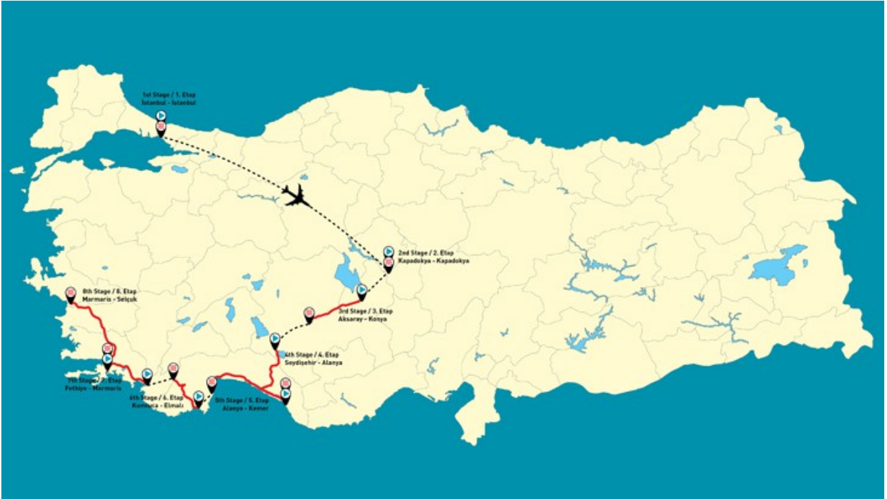
Stages of the Tour 2016

Created in 1968, but annually organized since 1998, the Tour of Turkey keeps growing in the international calendar (HC race from 2008). Like the Tour of Croatia, it's conceived as a touristic show-case : the seaside resorts and the archeological sites are landmarks on the route and the broadcast emphasizes them with numerous extreme wide shots. In late April, a lot of potential tourists are in search of vacation ideas and attractive summer holidays destinations. What about a future finish on the Trojan Hill ?