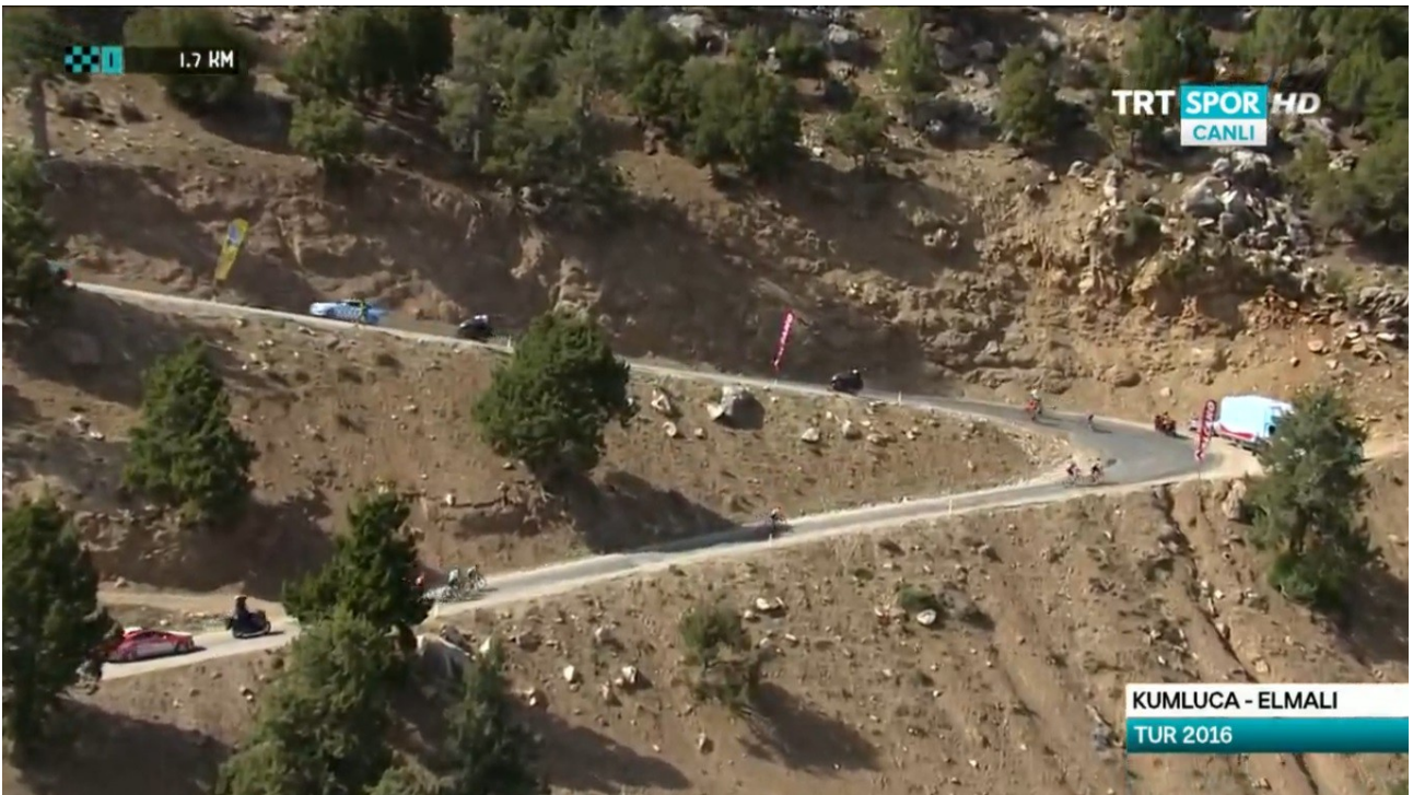
The second last hairpin bend : 10% before, 11 after