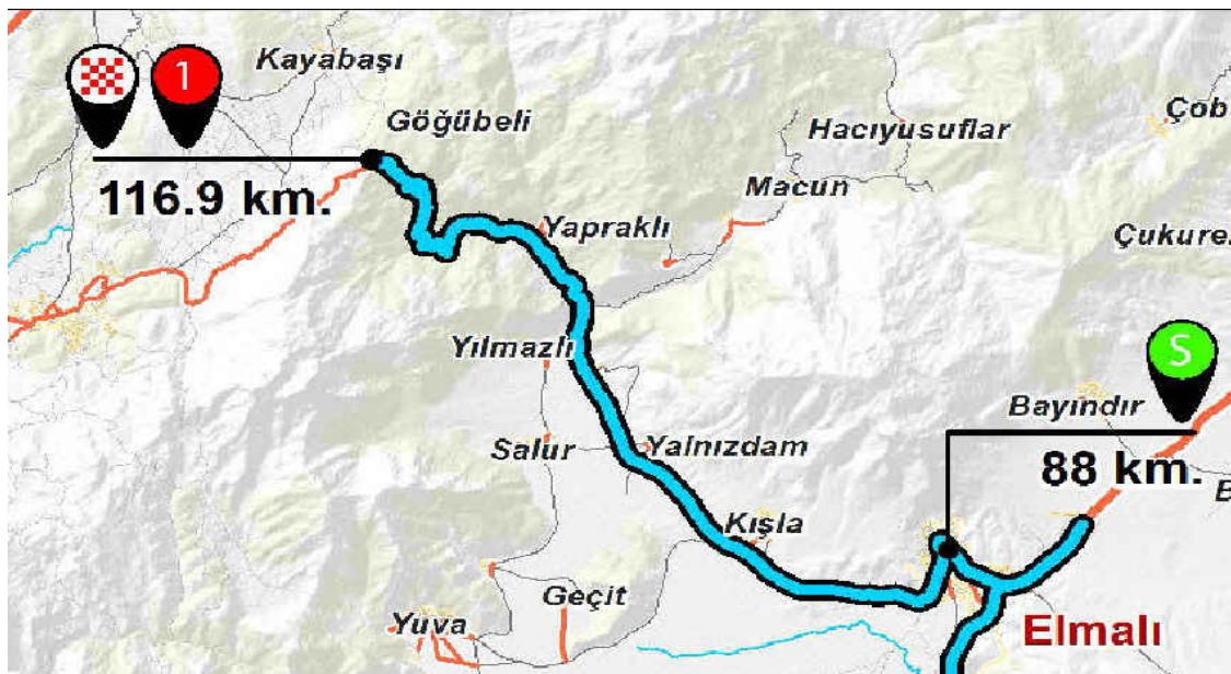
Last part of the 6 th stage 2016

And like every race worthy of the name, its organizers have found a very spectacular uphill finish. In Turkey, since a few years, the Göğübeli Geçidi (pass) plays the role of « classification maker ».