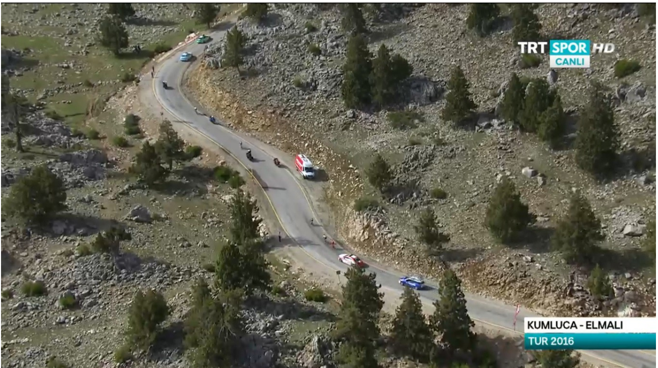
Bird's-eye view of the last km