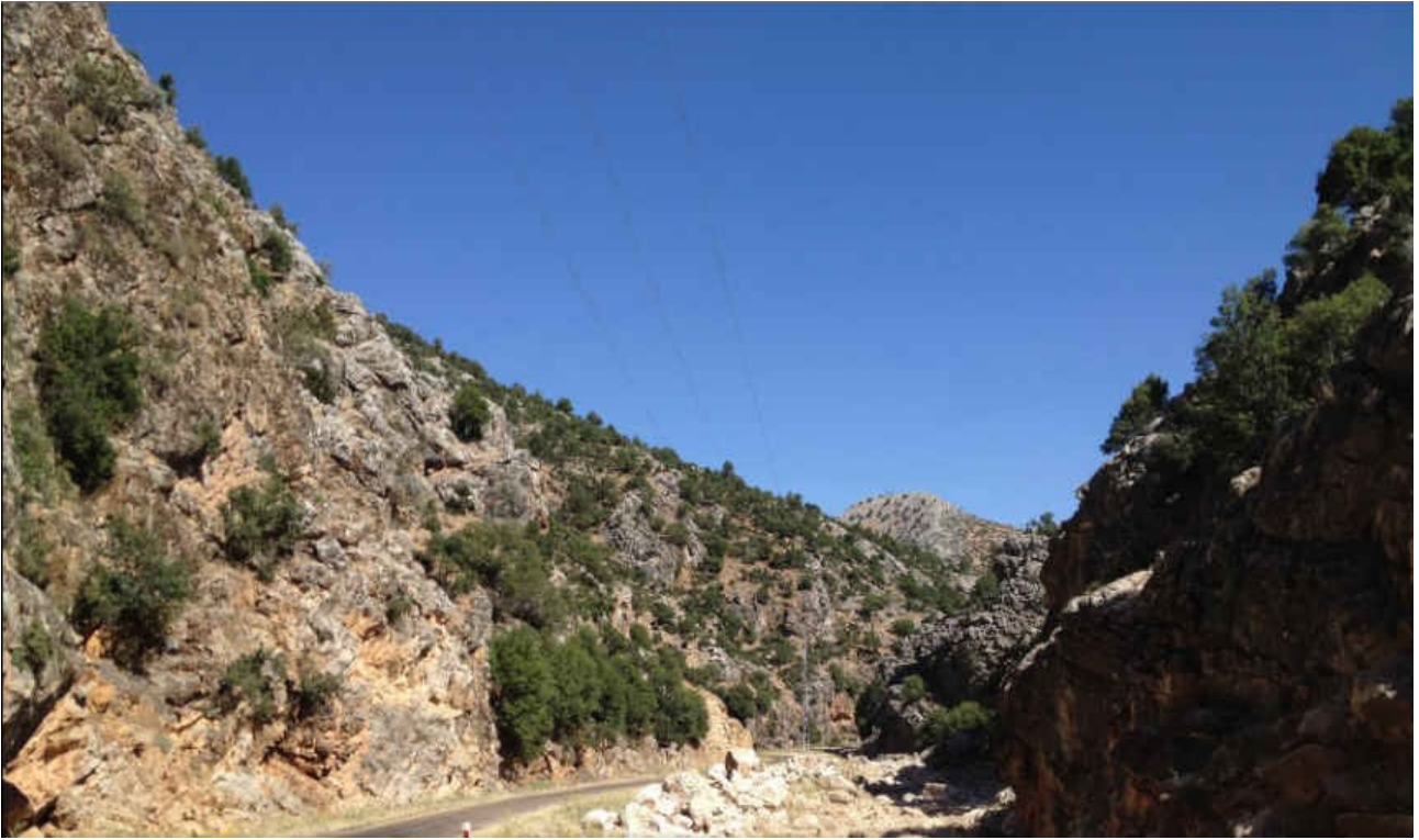
Still reasonable gradient in the gorges