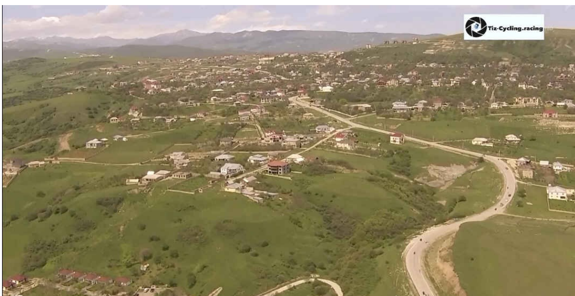
Nagraxana village, 5km before the finish line