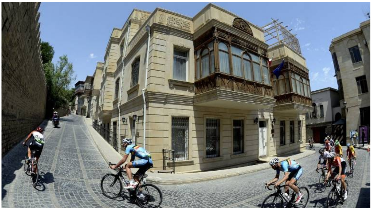
Along the walls of the Old City (Baku - European Games 2015) (BIG873)