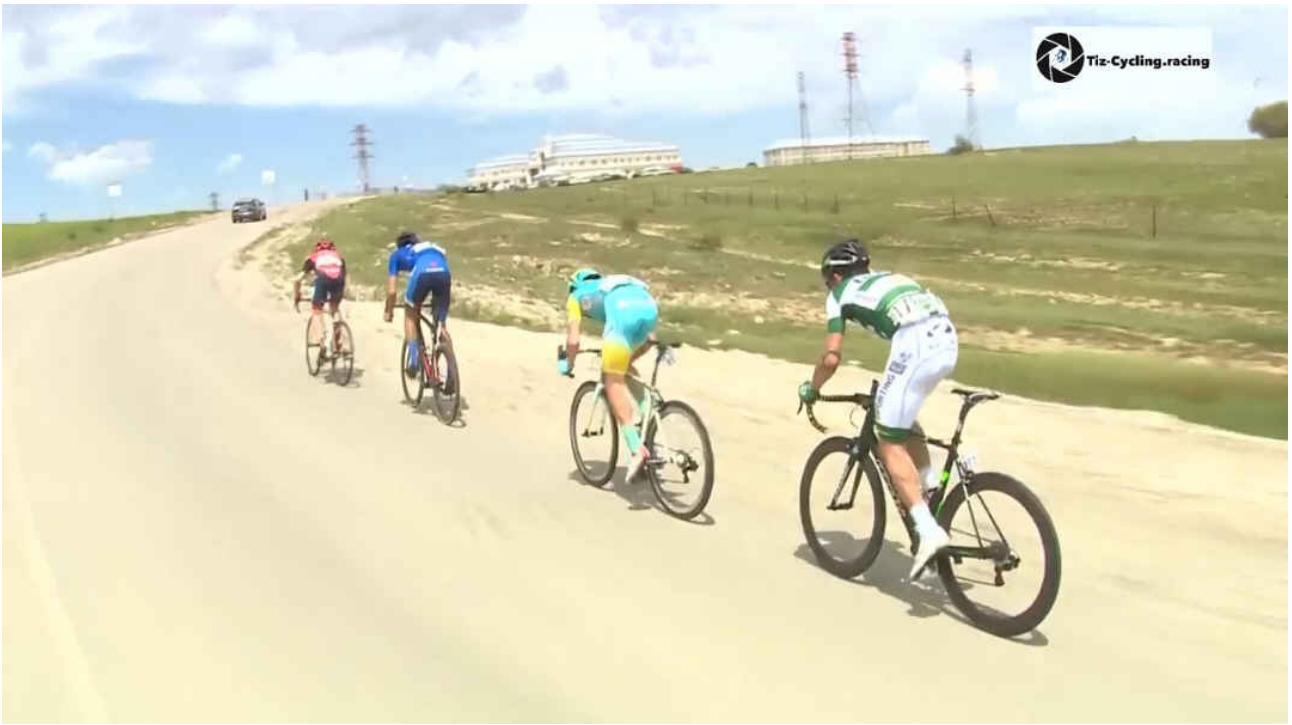
Final sprint, 400m before the finish