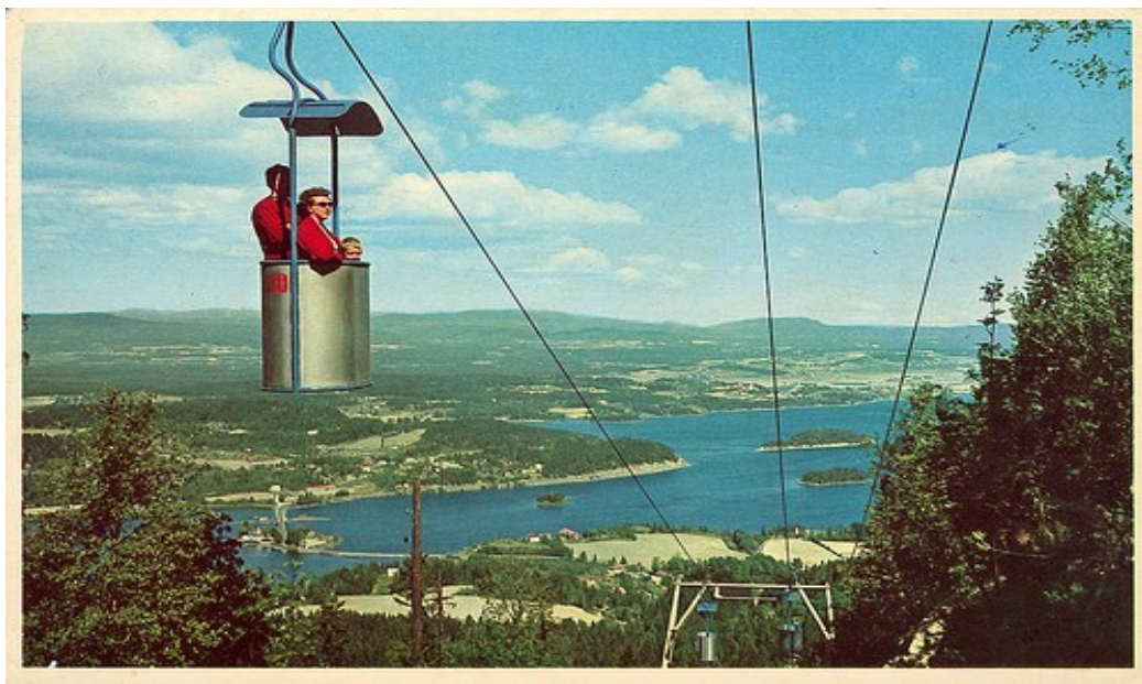
Tyrifjorden seen from Krokkleiva