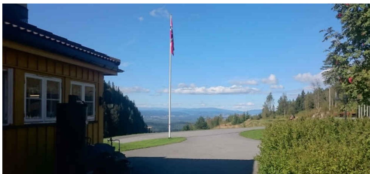
Top at Kleivstua

The picture is to be found on the website of Pierre Moncorgé, French amateur cyclist, who takes part of races everywhere in Europe. A lot of summaries (only in French) on http://www.pierremoncorge.com/ .