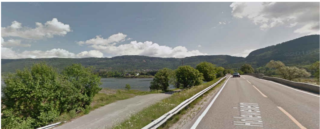
Krokkleiva on the horizon

Climb of Røine : https://www.youtube.com/watch?v=4EU6I-4K444