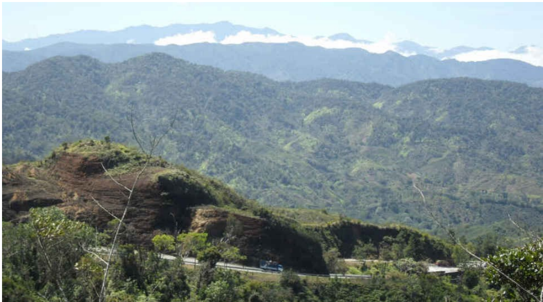
Cordillera Central in the background