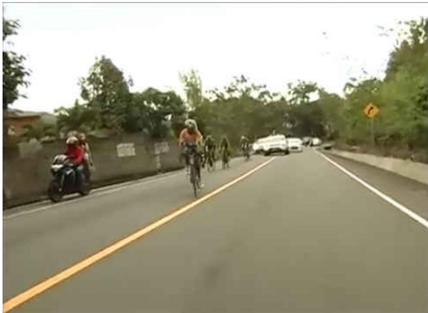
Leaders in the hard part