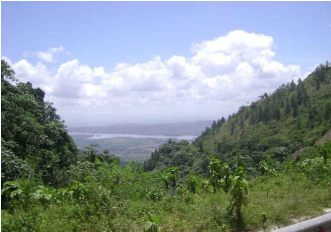
Viewpoint to the lake « La Presa de Rincón », in the first part of the climb