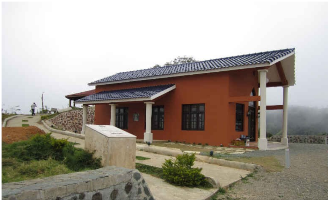
Alto de la Virgen