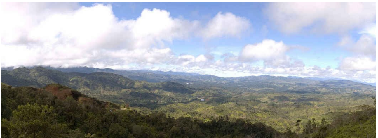
Torre de observación Casabito, not so far from the Virgen