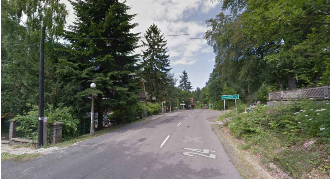
Crossroads in Mátraháza, to the right (km12,9)