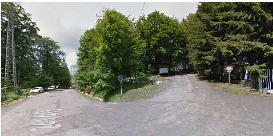
km16,7 – Rear view and entrance in the touristic zone