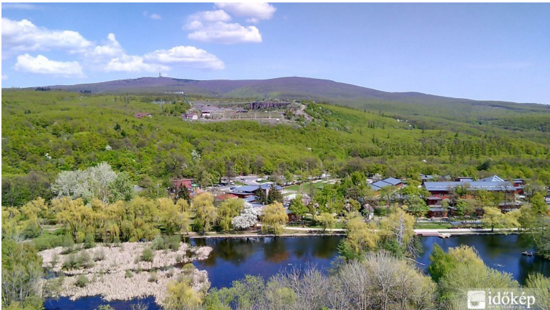
The summit seen from the valley

Across Palosvolosmart as far as the crossroads in Mátrafüred (km4,4)