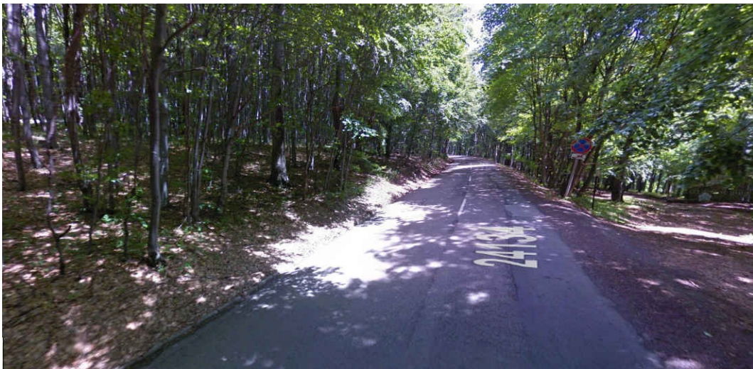
km 15,7 – 9%