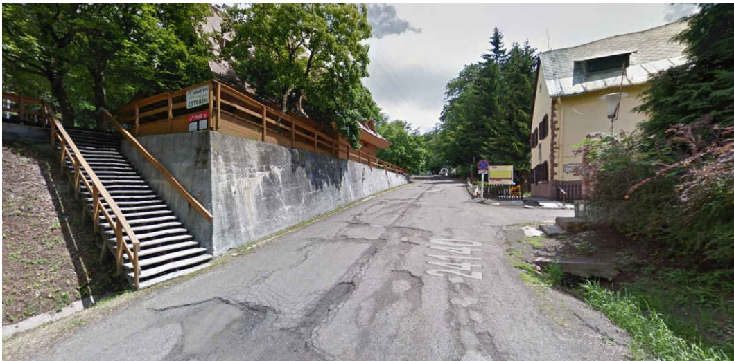
km16,5 – Last effort 10%