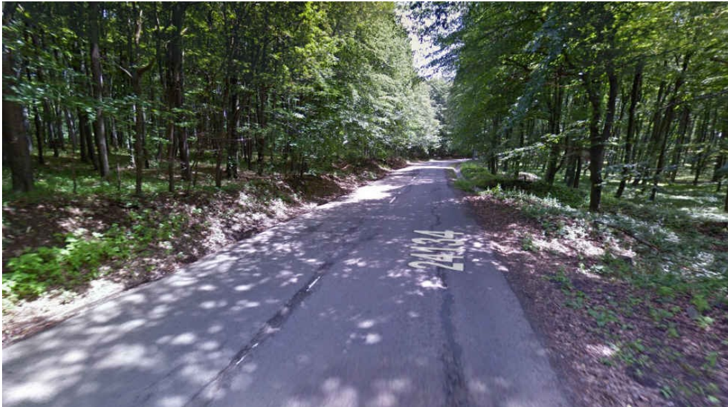
km14 – 11% - Woody fragrance