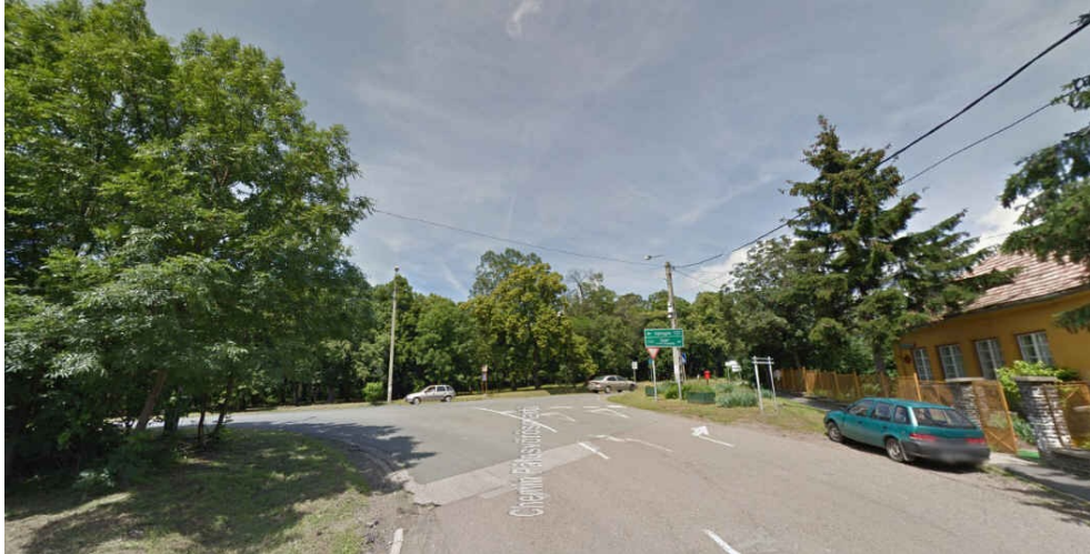
Crossroads in Mátrafüred

2- On the A-road, 6km very steady (5%) in a green setting