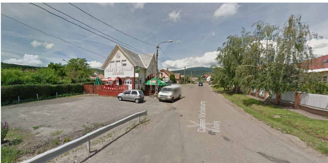
Foot in Abasár – slight uphill