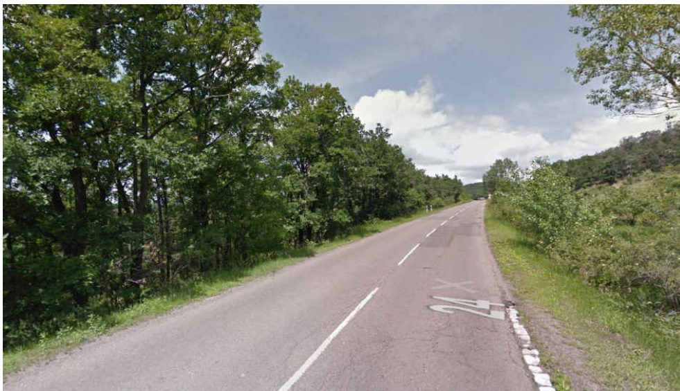
Straight line - km9. Same setting, slighter %