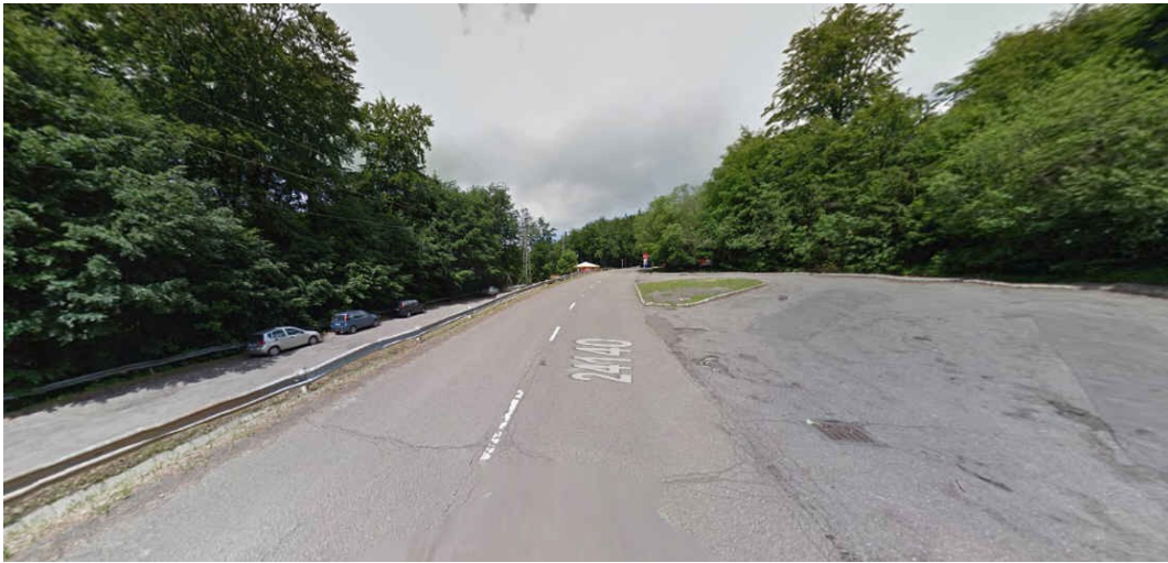
km16,3 – Car park 5%