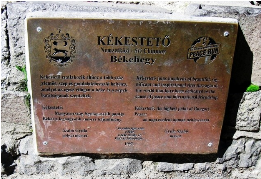
The stele is dedicated to the Peace – Still a lot of work

The whole climb « Tour de Hongrie 2016 » to be seen (from 1h12) on :