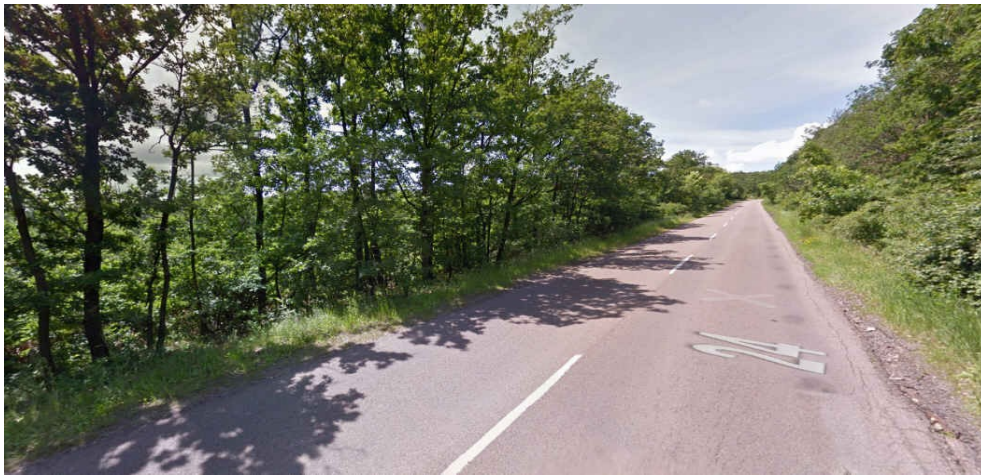
Straight line - km7

2- On the A-road, 6km very steady (5%) in a green setting