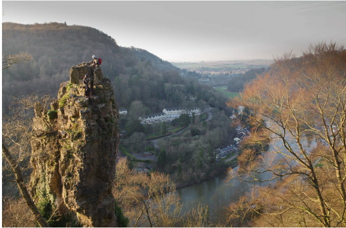
Symonds Yat Rock

In the very romantic Wye Valley we chose Symonds Yat Rock, and also Tintern Abbey for the Welsh part.