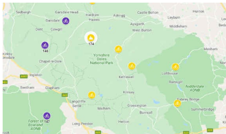
Excerpt from Google map in the Pennines

In the Pennines we have the National Parks and AONB (North Pennines AONB, Yorkshire Dales NP, Nidderdale AONB and Peak District NP). A detailed list of the selected climbs appears in the « Tourism » section. The Google map will help you to locate them easily.