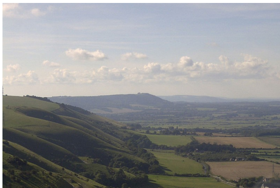
Sussex Hills from Devil's Dyke

Beside its nice media climbs, Surrey has two protected natural sites: AONB Surrey Hills (Barhatch Lane, Leith Hill and Box Hill) and the South Downs NP (Devil's Punch Bowl and White Downs).