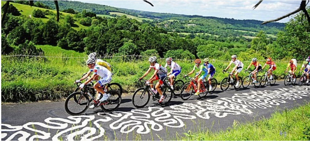
Box Hill – London 2012

South of London (in Surrey), Box Hill is the place to be. Just a few climbs in the world have the Olympic label. Barhatch Lane was several times KOM 1 st cat. in the Tour de Britain and Leith was 2 nd cat.