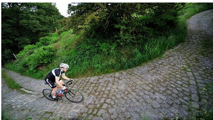
The Corkscrew – 45% declared!