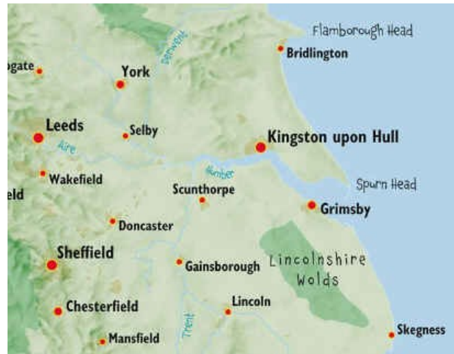
The Wolds around Kingston upon Hull

East Yorkshire (north of the Humber Estuary, Kingston upon Hull), is the land of the « wolds », hills of low altitude, but often very steep. We've chosen four of them, to give a foretaste. The « Wold Land » stretches southwards, into Lincolnshire (Normanby le Wold in our list).