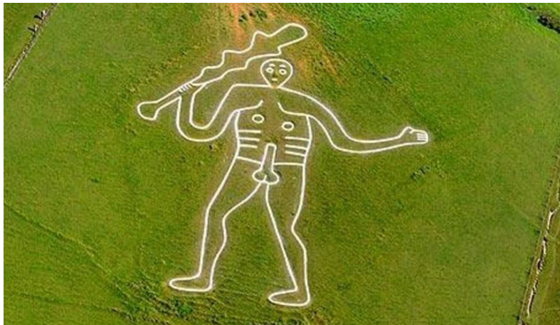
Cerne Abbas Giant