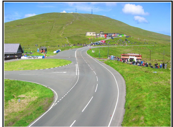
The Bungalow (Man)