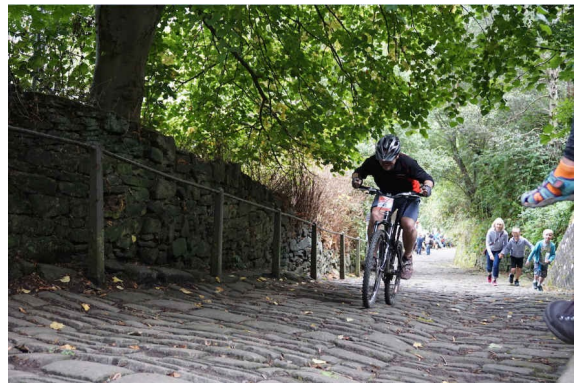
Up the Buttrass!

Grade A for the Hell of Worth, a sportive with 22 very bad cobbled climbs (list for 2016):