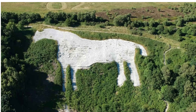
Kilburn White Horse