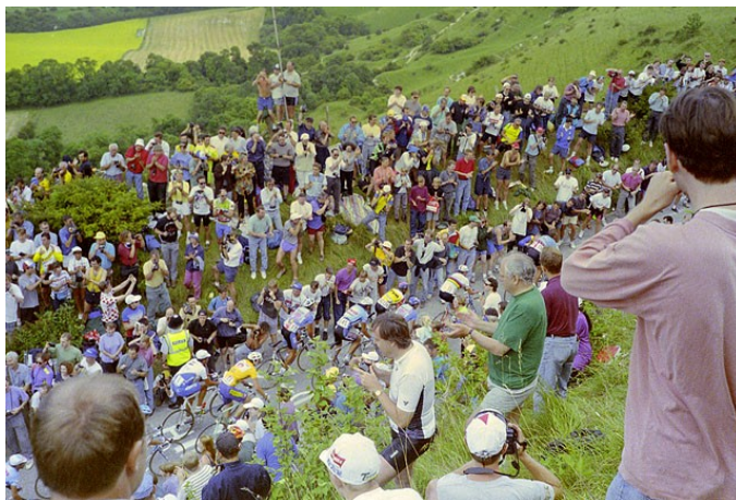
The Tour de France in Ditchling Beacon

Ditchling Beacon is the most media climb in East Sussex (Tour de France 1994, NHC in 1995 and also KOM 1 st cat. in the Tour of Britain).