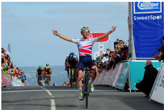
Simon Yates above Haytor Vale (Tour of Britain 2013-06)