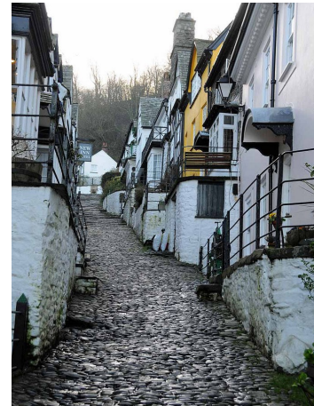
Cobbles in Clovelly