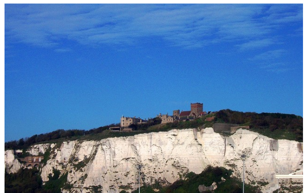
Dover castle above the white cliffs