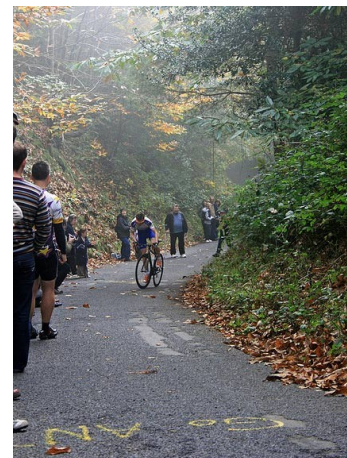
York's Hill Climb

Lastly visiting Kent, where the oldest race ever was organized in 1887. Firstly on Westerham Hill, then on York's Hill, which we've chosen. White Hill was KOM in the Tour de France 1994.