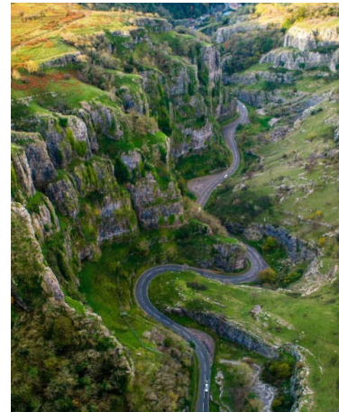
Gorges de Cheddar