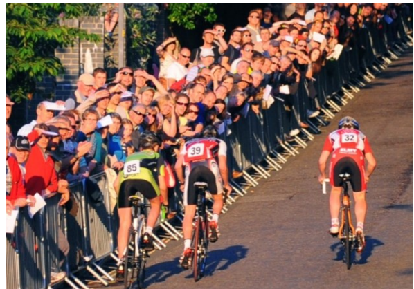
Gas Hill in Norwich