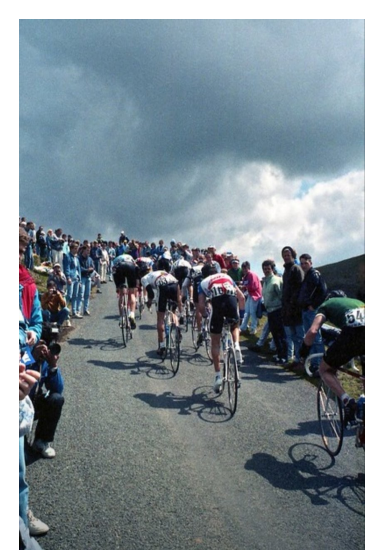
Bwlch-y-Groes Milk Race 1988

3 climbs exceed 500 europoints: Moel Famau (613), Marchlyn Mawr (531) and Bwlch y Groes (521). Then another BIG, Devil's Staircase (467), the monster Church Hill (431) and the well named Road to Hell (398).