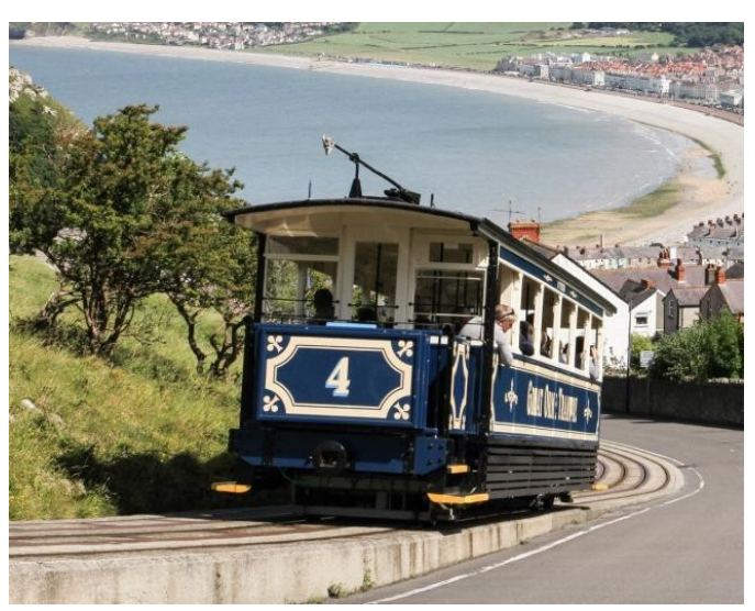
Down from Great Olme