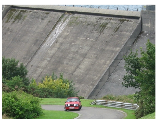
Speed Hill Climb at Llys-y-fran Reservoir (bottom of Mynydd Preseli)

In the south-west, Pembrokeshire Coast National Park has 3 climbs: Newgale Hill, Newton Mountain in the Cleddau Valley and Mynydd Preseli.