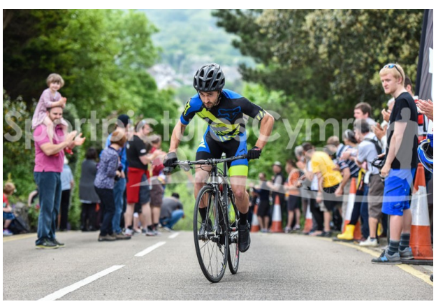
Dandy horse on Cefn Llan