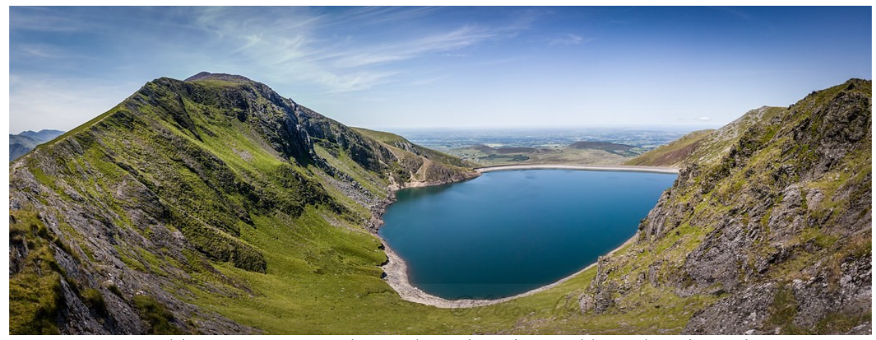
Marchlyn Mawr Reservoir, number 2 in points and best elevation gain

3 climbs exceed 500 europoints: Moel Famau (613), Marchlyn Mawr (531) and Bwlch y Groes (521). Then another BIG, Devil's Staircase (467), the monster Church Hill (431) and the well named Road to Hell (398).