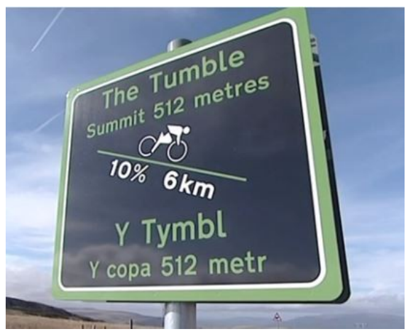
A real road sign, like the big climbs

Rhigos and Black Mountain are also regularly visited. And we'll end the zakuski with the short, but lethal bomb Constitution Hill, defused by Albasini in 2010.