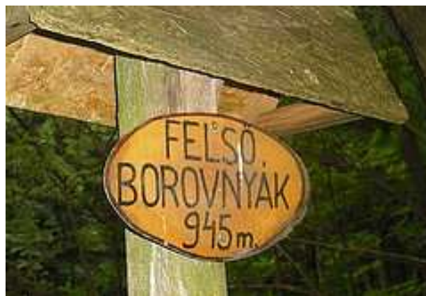
One BIG with a great circle!

The route: Eger – Felsőtárkány – Nagymező – Felső-Borovnyák – Olasz-kapu – Szilvássvár – Bélapátfalva – Mónosbél - Szarvaskő – Eger